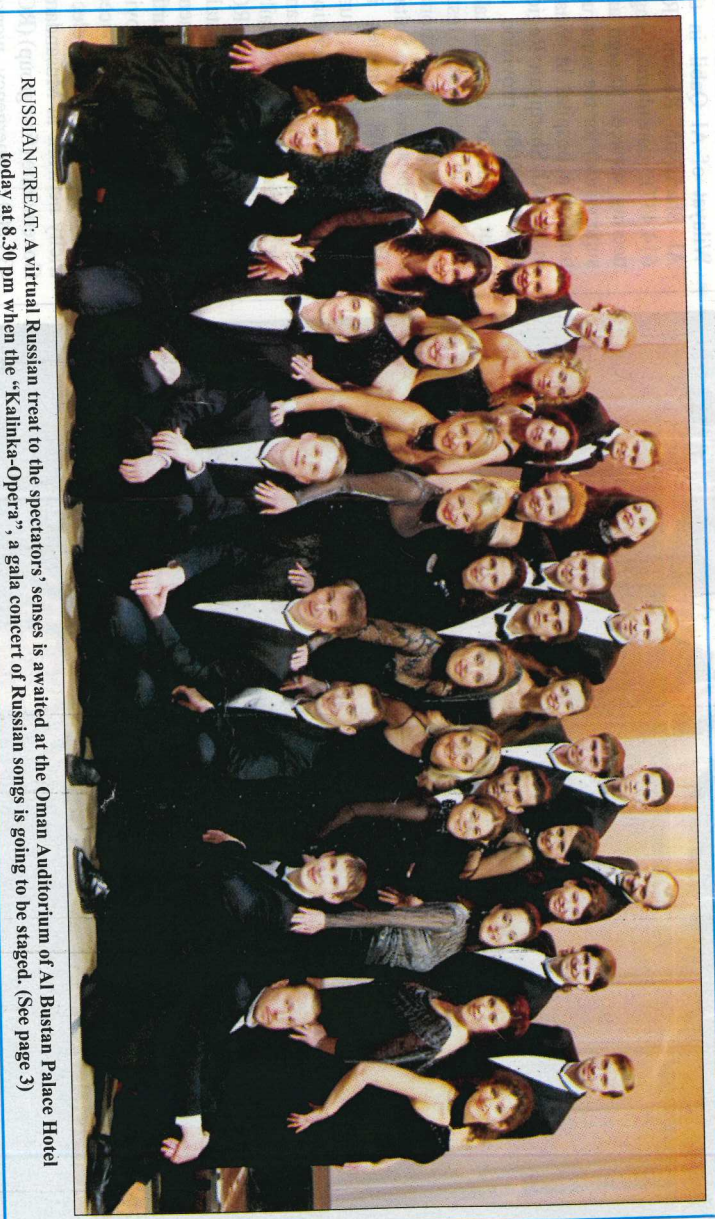
RUSSIAN TREAT: A virtual Russian treat to the spectators' senses is awaited at the Oman Auditorium of Al Bustan Palace Hotel today at 8.30 pm when the "Kalinka-Opera", a gala concert of Russian songs is going to be staged. (See page 3)

Brent North Sea crude for delivery in November reached $85.88 a barrel — the highest level since May 5. It later stood at $85.57 — up 73 cents compared with Tuesday's close. New York's main contract, light sweet crude for November won 82 cents to $83.64 a barrel. Earlier yesterday it struck $84.09, last reached on May 4. Prices rose as the dollar slumped to a six-month low against the euro and gold hit